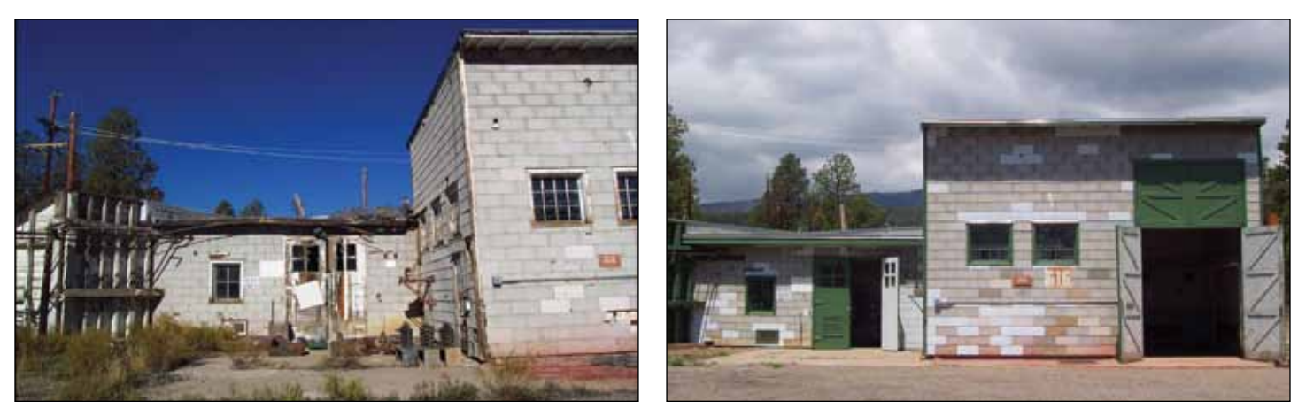
Los Alamos V-site before and after restoration.

However, funds for restoration would have to come from some other source.