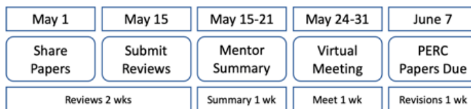
Figure 1: Timeline for participating in the PER Review Network.

The figure below lays out the proposed timeline for participants in the PER Review Network. This timeline may shift until the PERC deadline is set in stone. For mentors and participants alike, the PER Review Network allows getting to know researchers from other groups and with different research goals. Mentors will get to meet new students who may become the next post doc they hire or a post doc who may become colleagues in their department.