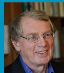
Alan Rugman 1945-2014