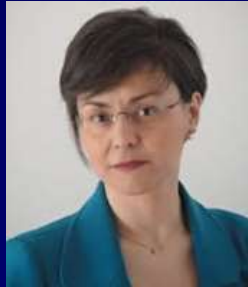
Grazia Santangelo Research