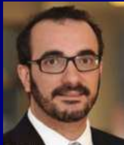
Luiz Kabbach de Castro Membership