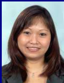
Chei Hwee Chua Communica- tions