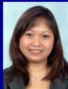
Chei Hwee Chua Communications