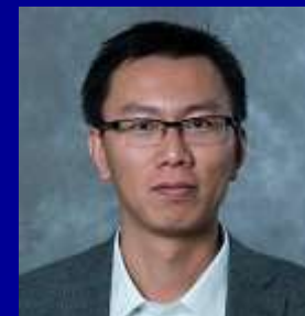
Sali Li Online Research