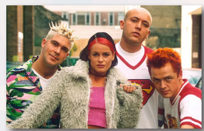
Danish Pop Group - Aqua