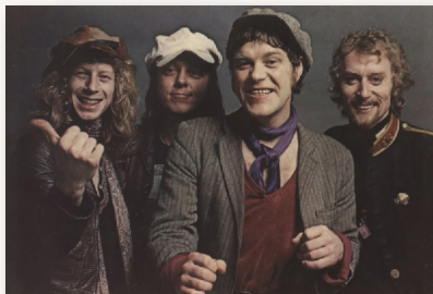
Danish Rock Band - Gasolin'