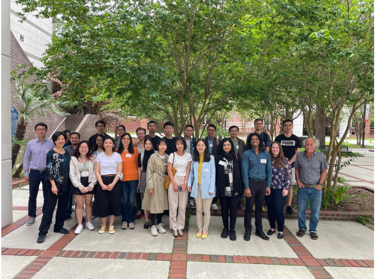
Attendees of the Florida Chapter meeting gather Saturday morning for a group picture.