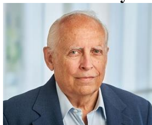
North Carolina State University