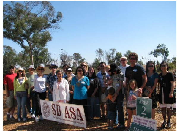
San Diego Chapter 2011 Annual Fall Picnic