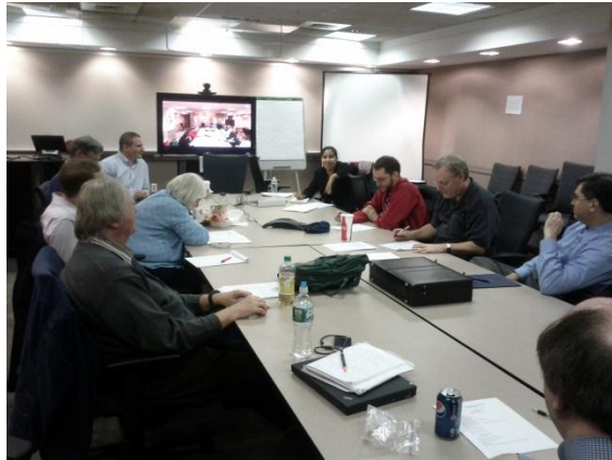
Members discuss issues at a recent meeting Washington Chapter meeting

WSS has a full upcoming spring schedule. The WSS Quantitative Literacy team has been active and is gearing up for their spring activities that include science fair judging and awards, the Curtis Jacobs Memorial awards,