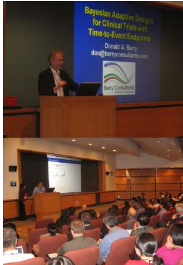
Scenes from the 9 th Annual ASA Connecticut Chapter Mini Conference - March 8, 2011

The conference also featured a panel discussion led by three speakers from the pharmaceutical industry to illustrate case studies and introduce challenges