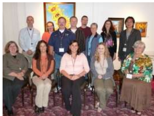
Fall 2010 Middle TN Chapter AP Statistics Teacher retreat participants

The Middle Tennessee Chapter is very interested in encouraging young people to consider a career in statistics. Our chapter had several ideas about how to do this including hosting a statistics fair, visiting schools with career days, and hosting a statistical computing course for students. We were certain, however, that without the support of our local teachers, any effort we made would fail. Through generous funding from an ASA Member Initiative, the Middle Tennessee Chapter hosted a retreat for area high school Advanced Placement Statistics teachers.