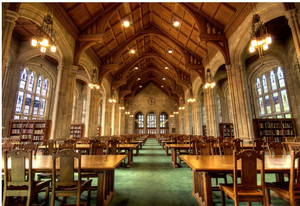
Beinecke Rare Book & Manuscript Library, New Haven Connecticut