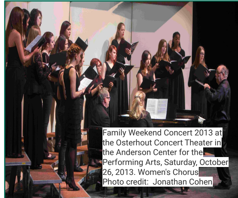
Family Weekend Concert 2013 at the Osterhout Concert Theater in the Anderson Center for the Performing Arts, Saturday, October 26, 2013. Women's Chorus