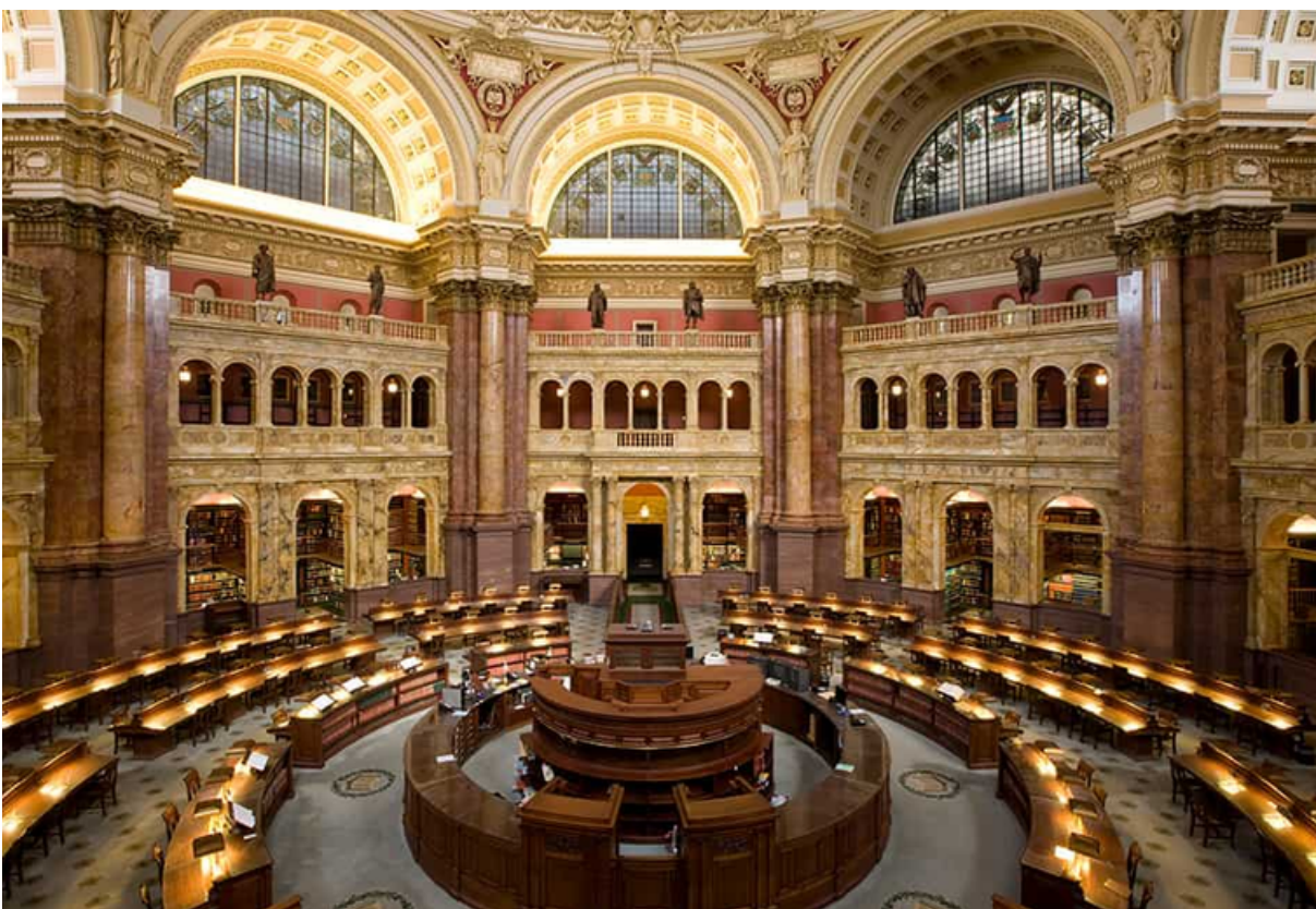
The Library of Congress, Washington, DC