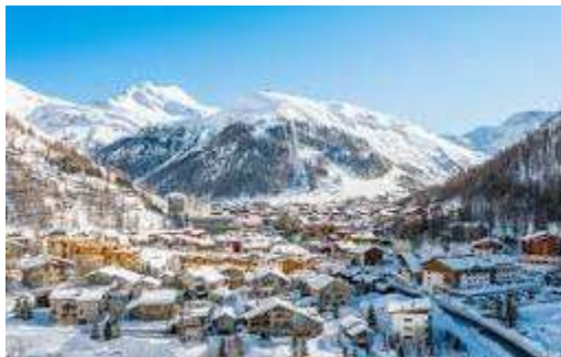
First Global Sourcing Workshop, Val d'Iser, France, 2007