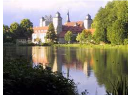
ICOIS 2001, Castle of Thurnau, Thurnau, Germany, 2001