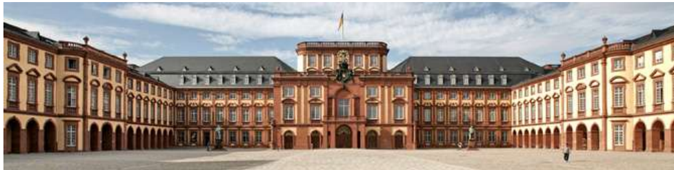
ICOIS 2013, Mannheim Palace, Mannheim, Germany, 2013