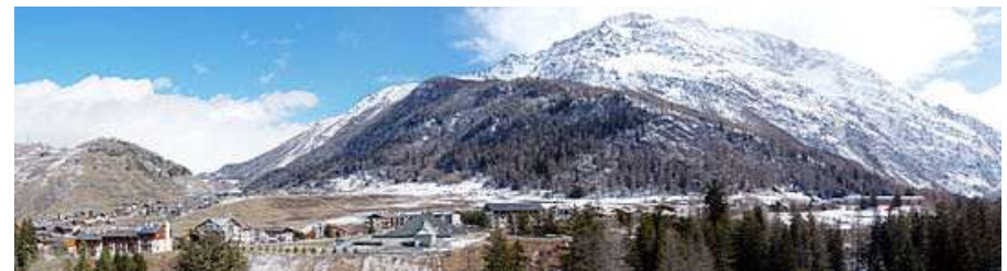
Ninth Global Sourcing Workshop, La Thuile, Italy, 2015