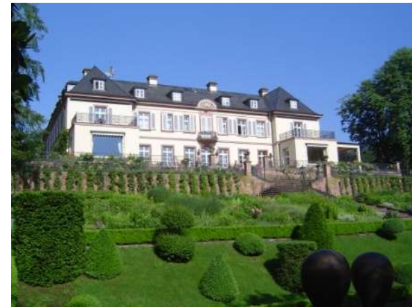
ICOIS 2007, Villa Bosch, Heidelberg, Germany, 2007