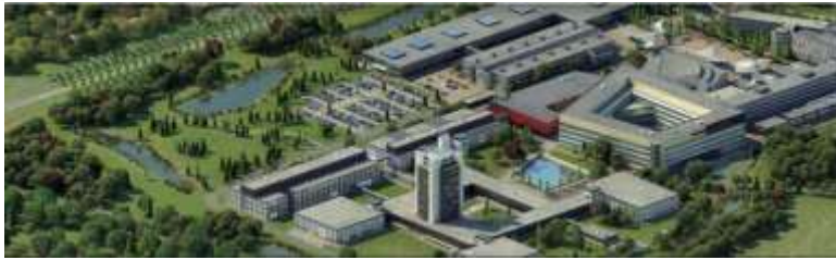
OUT'93, Twente University, Enschede, Netherlands, 1993