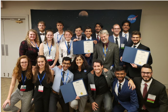
Florida Tech Student Branch Members with Astronaut Sunita Williams at AIAA Region II Student Conference, April 2019

Branch's Community Outreach Efforts was recognized as First Place in the "Community Outreach" category, and the Embry-Riddle Student Branch earned second prize in Community Outreach.