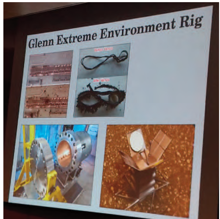
Simulation of Venus conditions to test endurance of equipment destined for the planet.

These facts only begin to reveal the oddness of Earth's cloud-shrouded neighbor. Though the surface of the planet turns very slowly, winds in the upper atmosphere whip around the planet at sixty times its rotation speed – circling the planet in about four Earth days. The difference between the fast circulation of the upper atmosphere and the slow rotation of the surface below creates some very interesting dynamics. For example, just as the Sun's gravitation pulls the Earth's oceans to create tides, it also pulls and distorts Venus's thick atmosphere as well as its surface. The intense solar heating of the atmosphere also creates additional expansion and deformations. These forces combine to