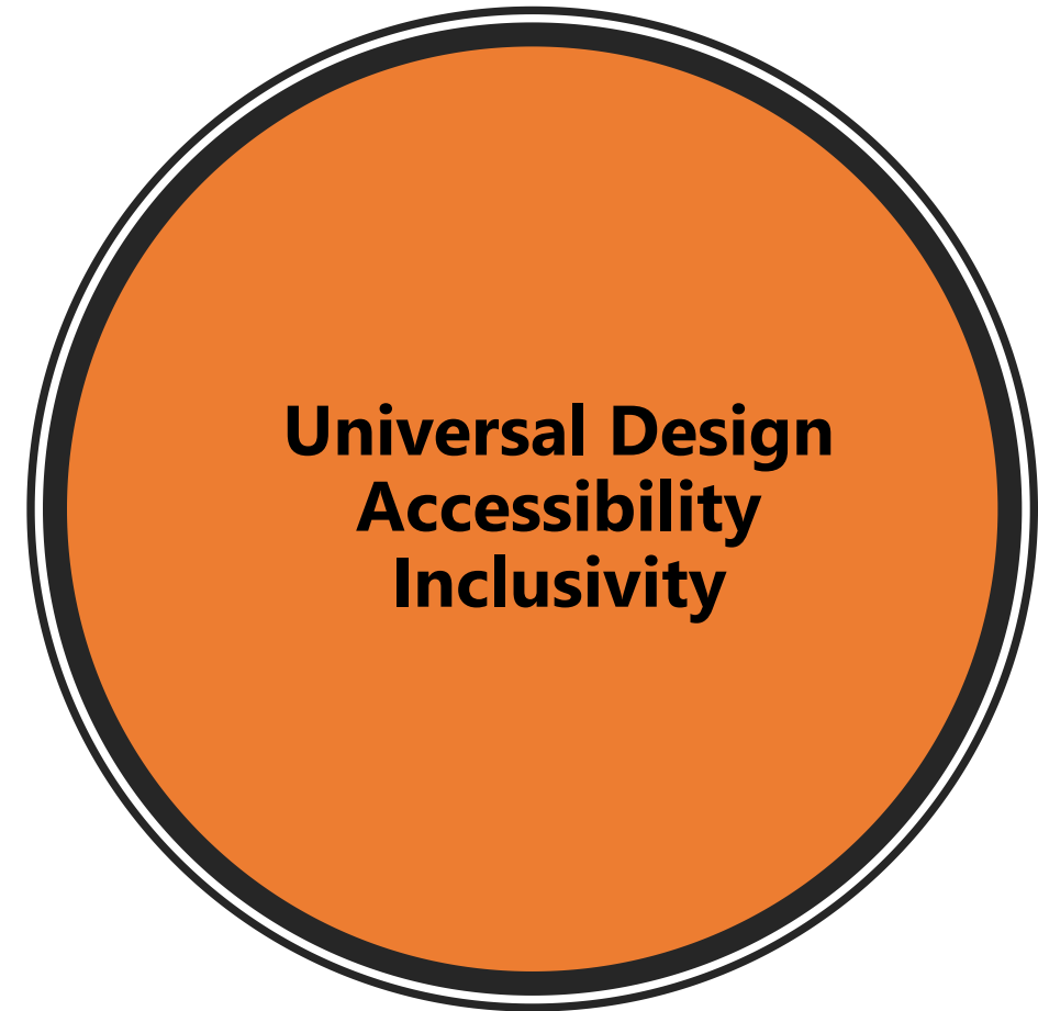
CLEARING A PATH

© 2002 MICHAEL F. GIANGRECO, ILLUSTRATION BY KEVIN RUELLE PEYTRAL PUBLICATIONS, INC. 952-949-8707 WWW.PEYTRAL.COM