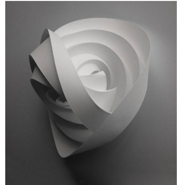
Matt Shlian, We Are Building This Ship as We Sail It , 2015 Cut and Folded Paper 14 x 16 x 10 in 35.6 x 40.6 x 25.4 cm

Collaborate with us! Visit https://bit.ly/beyondacom to share what you’ve been engaged in most recently.