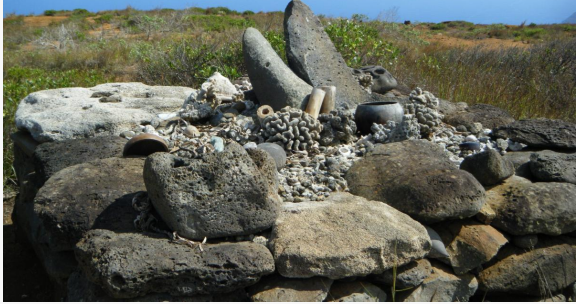
Photo of Kaho'olawe landscape