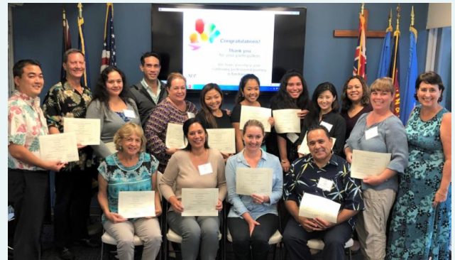
2018 Fundamentals participants show off their certificate of course completion.

If you want to improve your commitment to ethical fundraising, strengthen your marketing strategy or learn how to work with volunteers as partners in fundraising, taking the Fundamentals of Fundraising course will help you accomplish this and more. This fundraising certification curriculum course, developed and presented by the Association of Fundraising Professionals, is taught by Aloha Chapter members who have achieved their ACFRE/CFRE certification. If you are new to the fundraising field or know of co-workers or colleagues who would benefit from this course, please pass along the info: