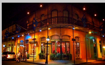
The 55th AFP International

Are you going to the AFP International Conference?