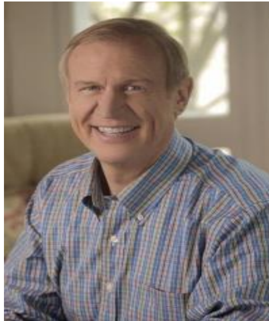
Bruce Rauner (R)

The Governor must also submit a balanced budget for the General Assembly to consider.