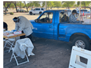
One of the last cars to be tested during Equality Health's second drive-thru testing event.