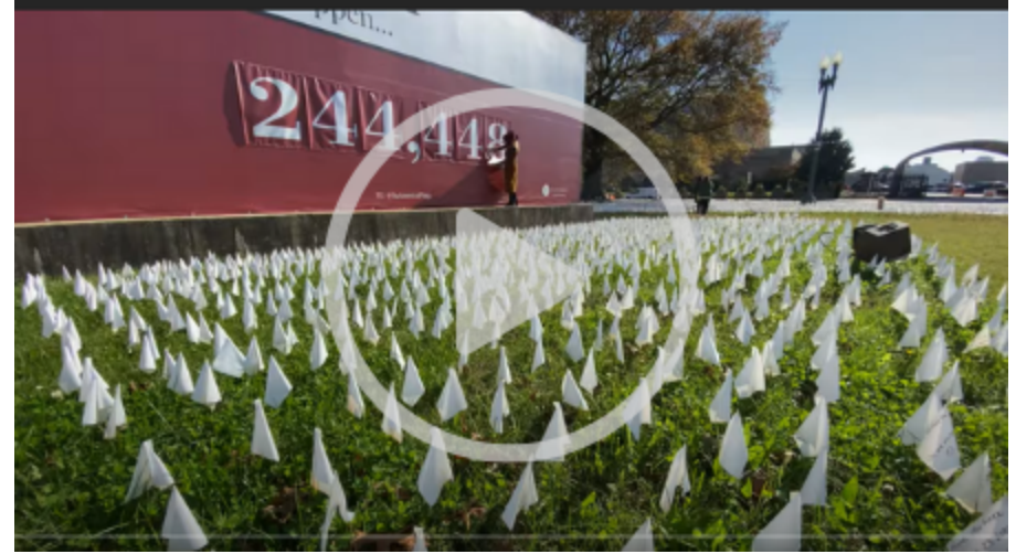
#MaskUpAmerica, COVID-19 USA Deaths: Field of Flags

Kaiser Family Foundation (KFF) <u>published an issue brief</u> titled "Estimates of the Initial Priority Population for COVID-19 Vaccination by State." KFF <u>released a policy brief</u> titled "How Has the Pandemic Affected Health Coverage in the U.S.?"