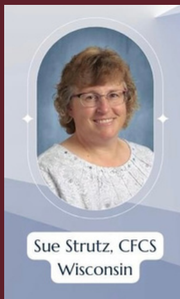
TEACHER OF THE YEAR Merit Finalist