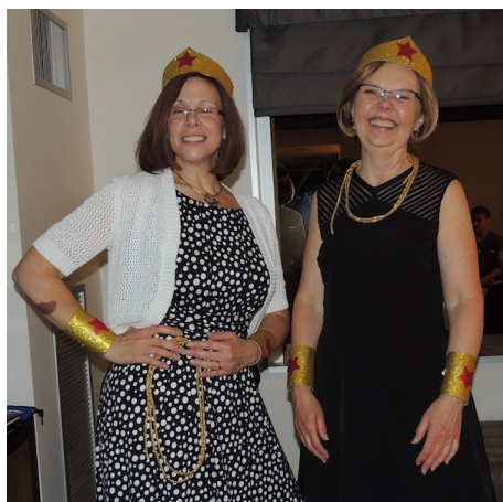
Wisconsin's Wonder Women