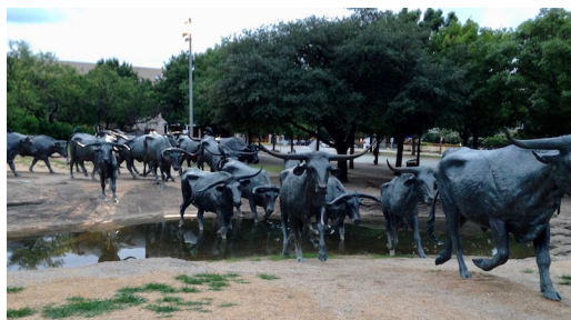
Cattle Drive Sculpture in Pioneer Plaza