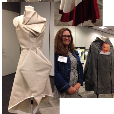
Original Fashion Designs