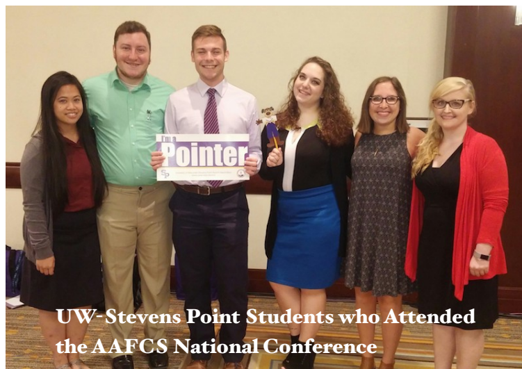
UW-Stevens Point Students who Attended the AAFCS National Conference