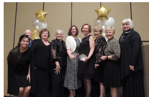
AAFCS Awards Dinner