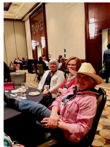
Boots, Bucks and Barbecue