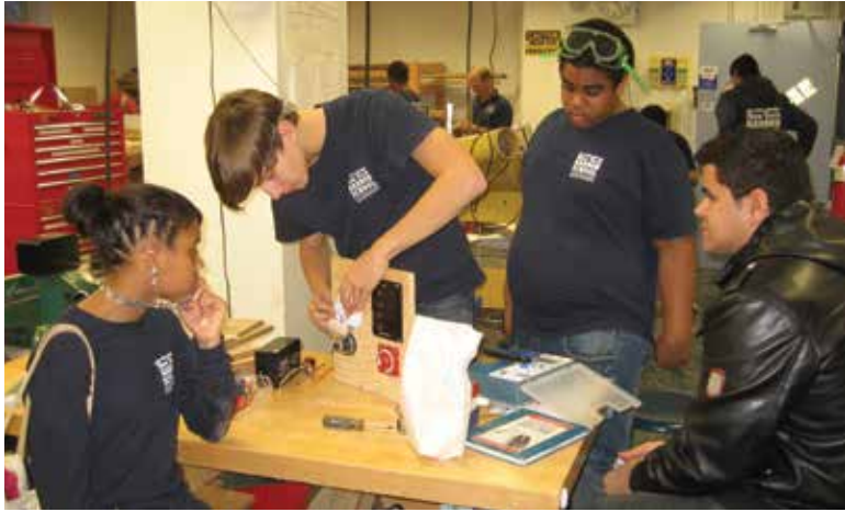
Students in the marine systems technology class.

that mechanics training was almost too easy to achieve for the student body, and the entire program was elevated to a very rigorous college preparatory program. The program includes high levels of original research and applied technology development, using the maritime environment as the research and testing ground. Programs range from on-water research projects to freshman year full-size cardboard boat design, construction, and operational evaluation.