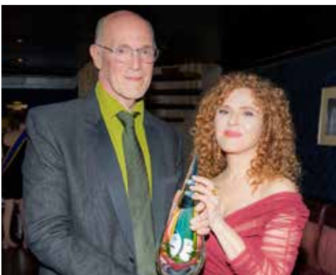
Neil Meron and Bernadette Peters

We all need good news these days, and so we are delighted to report back to you now on how we have been putting your contributions to work and advancing that resolution in ways that are already serving as a source of hope during these uncertain times.