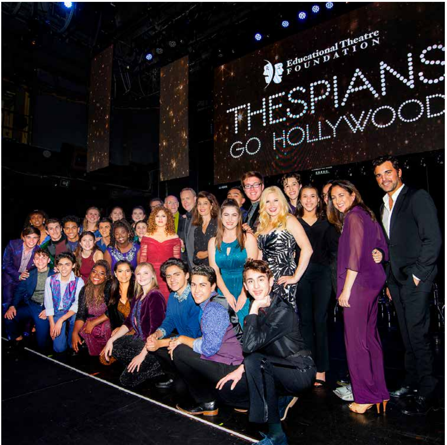
2019 Thespians Go Hollywood

It is in that spirit that we hope you will remain engaged in this profoundly important undertaking in Craig's name.