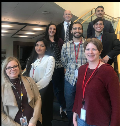
Pinnacle Assurance and 15 other companies hosted students for a semesterly shadow day this October.

CU Denver RMI Program thanks Rocky Mountain RIMS for your support of UCD RMI students!