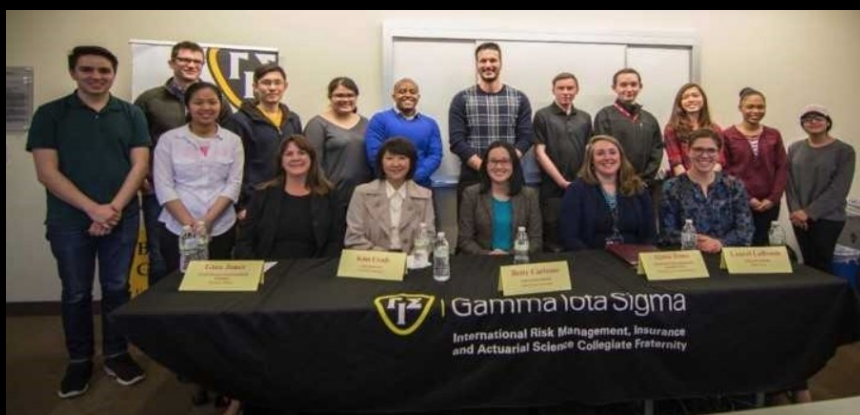
Gamma continues to grow as CU Denver RMI enrollment increases.