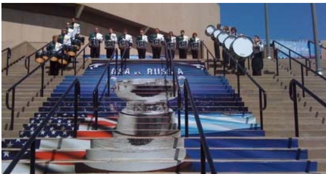
UAB Drumline performs at the 2010 Fed Cup Tournament at the BJCC!

Percussion ensemble performances by University of South Alabama, Auburn University, Spain Park High School, and Prattville High School. Clinicians will be announced soon!!!