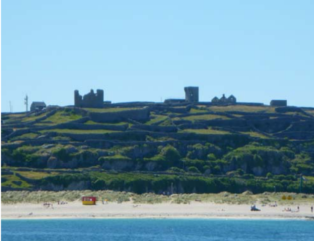
Approaching the stony landscape of Inis Oirr.

The afternoon elective class allowed more exposure to the teaching staff and their respective specialties. These additional classes included Irish bone playing (Stiofán O’Broin) and use of the bodhrán as a rhythmic voice in Eastern European folk music (Aimee Farrell Courtney).