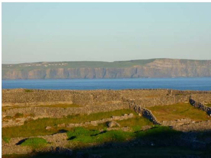
A view of the Cliffs of Moher from the author's lodging.