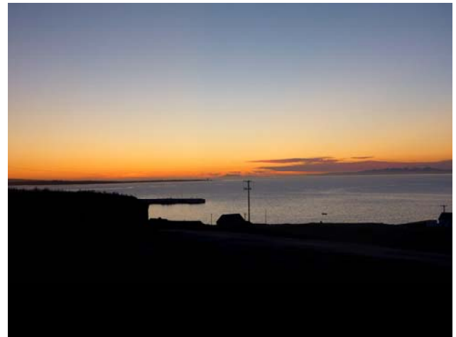
A view of the sunset....at 10:45pm.