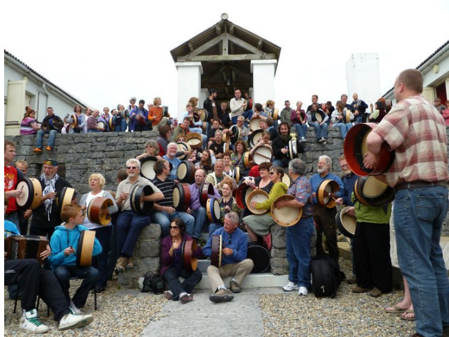
Setting up for the official 2010 Craiceann group photo.