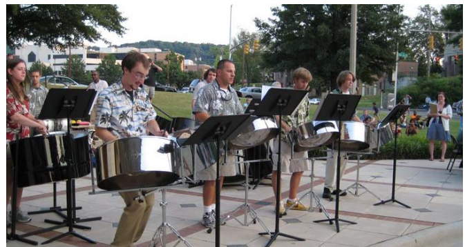
UAB Steel Band opens for the Alys Stephens Center's "InterARTive" Percussion Festival!