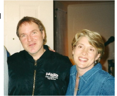
with Paul Wertico, longtime drummer for Pat Metheny