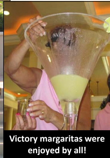
Victory margaritas were enjoyed by all!