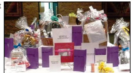
A sampling of the raffle baskets displayed at the 2011 APE.