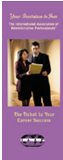
General Membership Information