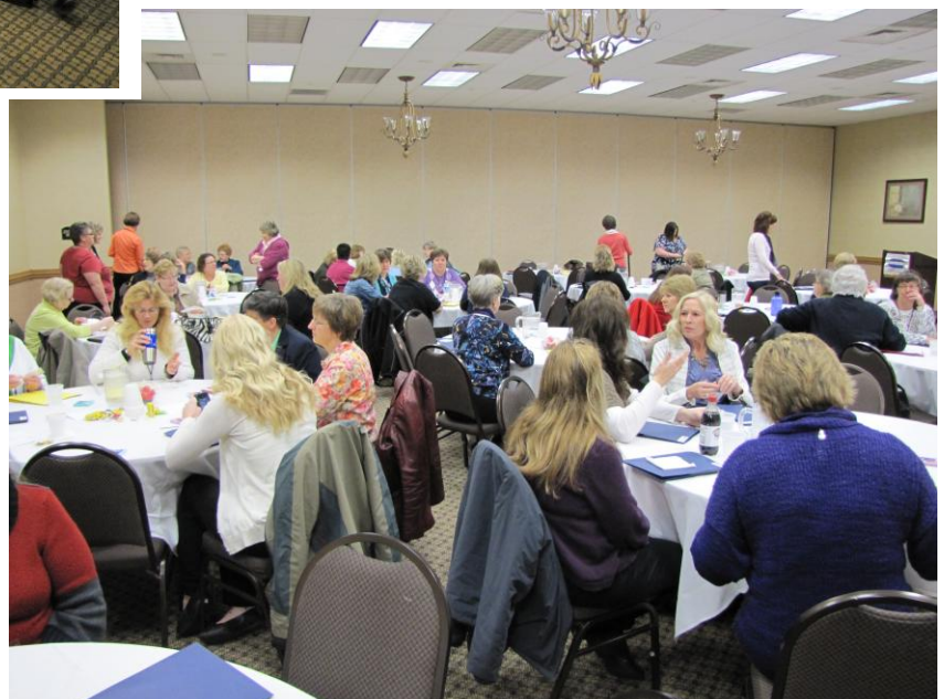
We had a full house with 145 registrants in attendance.