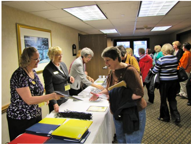
Registration and packet pick-up was a smooth operation!