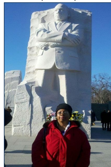
Dr. Martin Luther King, Jr. (1929-1968)