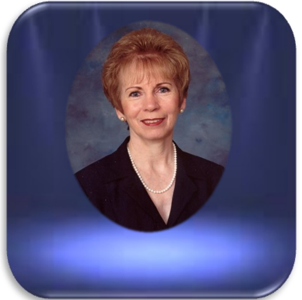
Alabama Division President, 2010-2011