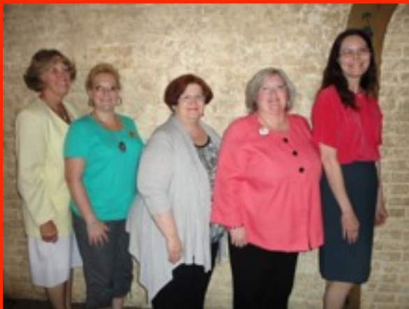
Johnson County Chapter IAAP Board Members for 2011-2012: Left to Right

I've been at the University of Kansas Hospital for seventeen years and have worked in the areas of academia, patient care, and information technology. I treasure the friendships that I have made during my time in IAAP. Get involved, and you will too!