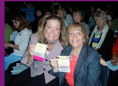
Look, we're official!