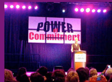
Keynote Speaker Erin Brockovich addresses the EFAM attendees.