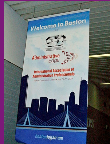
Welcome to Boston - EFAM 2010 !