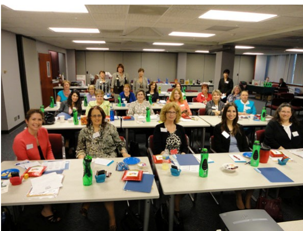
APW attendees enjoying the educational speakers.