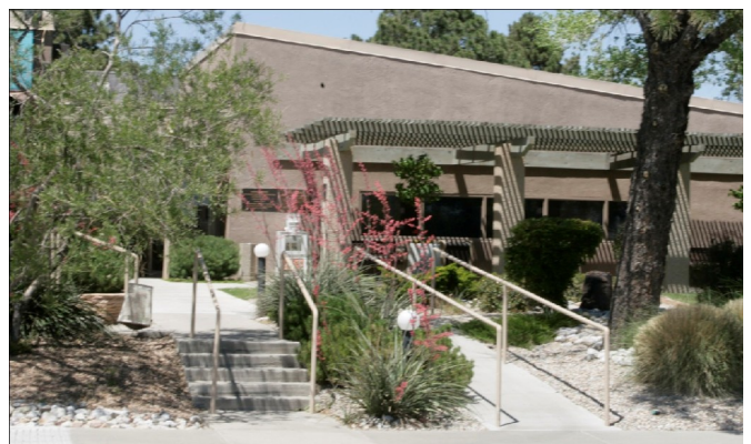
Exterior of a Vista Grande unit.