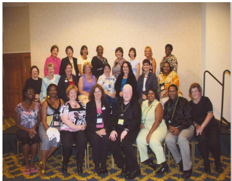
NCD Members take a moment to gather together at International in New Orleans.