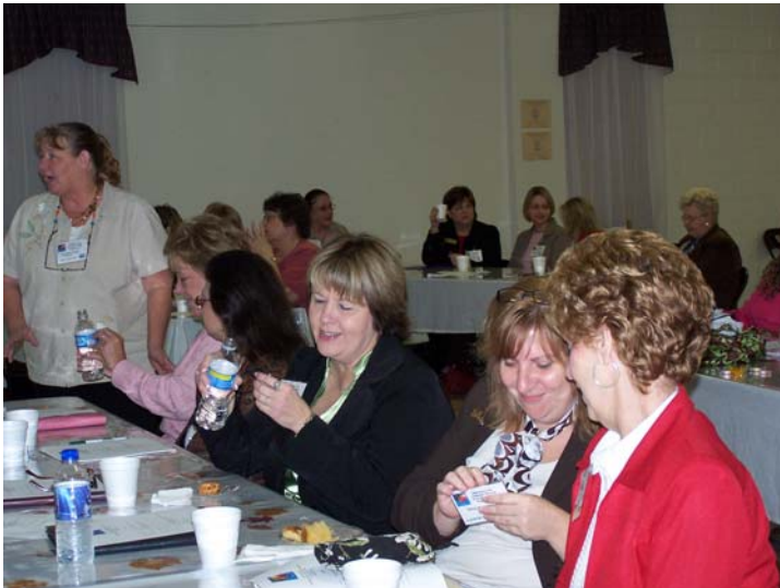
Just a sampling of some of the fellowship fun that we had in Morganton at our November Rise to the Challenge meeting!