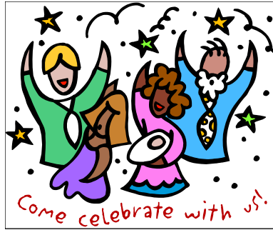
Members' special occasions can be emailed to AlohaNRA@aol.com