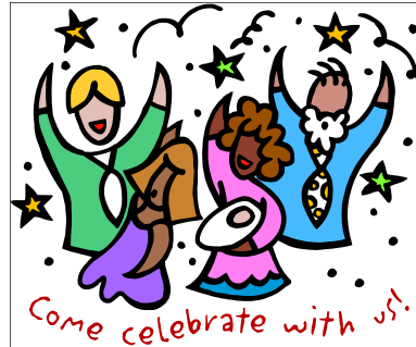
Members' special occasions can be emailed to AlohaNRA@aol.com