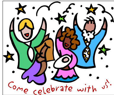
Members' special occasions can be emailed to AlohaNRA@aol.com