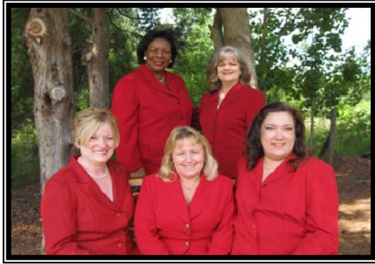
2010 - 2011 Georgia Division Board