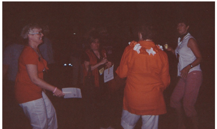
Boogie Down Ladies, Boogie Down!