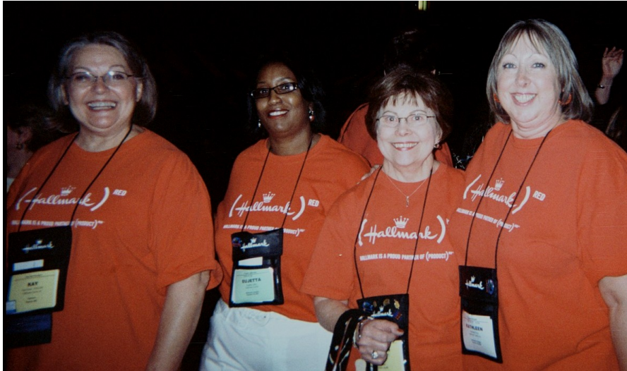
Hallmark Chapter, AKA "The Women In Red"

Ladies Room? Down the hall to the right, first door on the left.