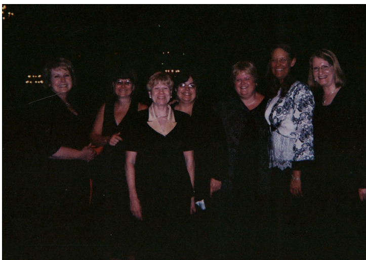
Missouri Division Members at the Final Night Banquet.