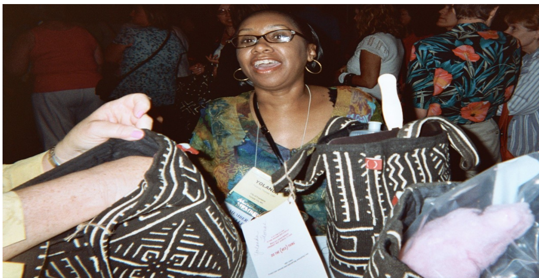
Hey! How did I get stuck holding everyone's purse?