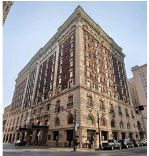
The Seelbach Hilton, Louisville, Kentucky

Check out IAAP's website for more details.