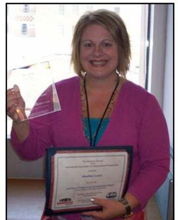
Heather Land Professional Development Award