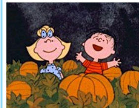
It's the Great Pumpkin, Charlie Brown, airs October 28, on ABC.